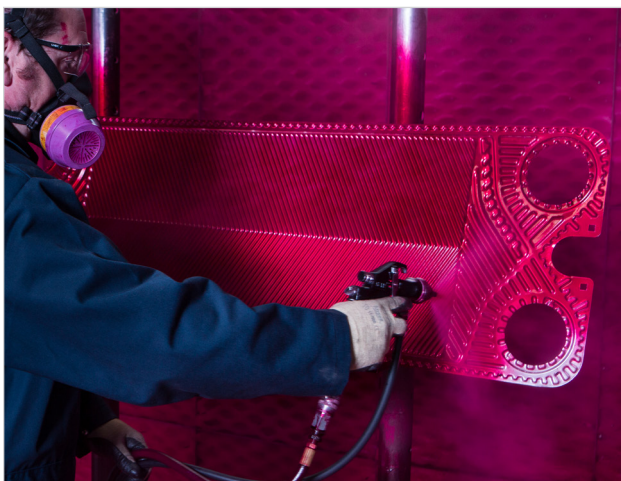
Plates are dye-penetrant tested for cracks, pin holes or material failure. Tranter Service centers are certified with dye-check NDT Level 1 & 2 LPT Inspection Training (AMSE Section V Div. 1)