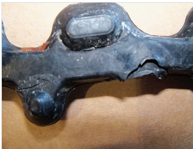
Non-OEM gaskets will cost you! The substitute gasket shown failed in less than 3 months, resulting in unplanned downtime and excessive maintenance costs.