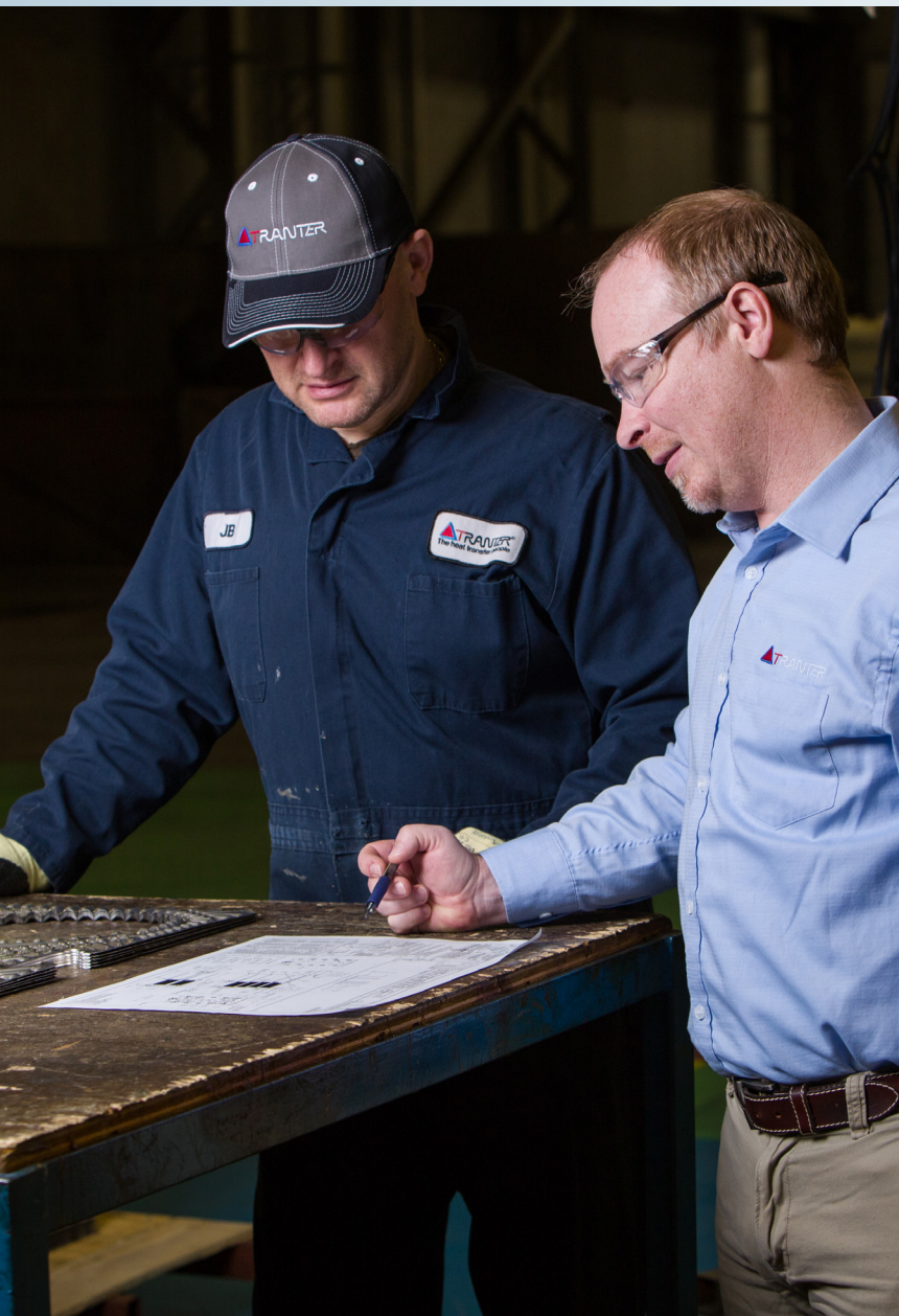
Complete plate pack refurbishment with OEM materials and procedures.