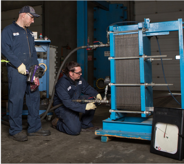
Entire unit refurbishment includes frame repair, complete plate pack service, reassembly and closing the unit to precise factory specifications. Sand-blasting and repainting is also available upon request.