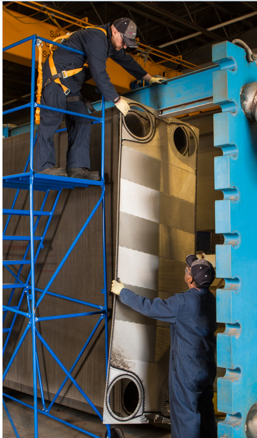
Our experienced technicians safely clean and regasket your plates, with all work guaranteed by written warranties covering materials and workmanship.

For premier heat exchanger service. Contact your Tranter Representative to schedule a field inspection!