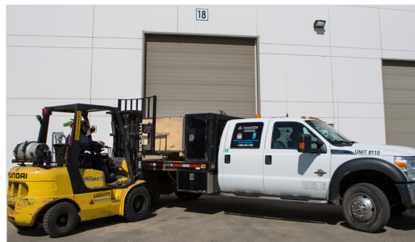
Tranter on-site teams stand ready to restore peak efficiency to your exchangers with minimal downtime.