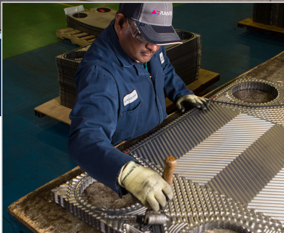
Plate & Frame Heat Exchanger Reconditioning Services