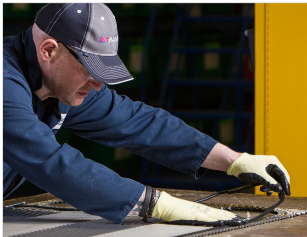
Plates are regasketed with OEM replacement gaskets and OEM-spec adhesives.

5. Tranter sequentially marks complete plate packs for ease of handling and proper orientation when installing plates. Current unit drawings are provided with each shipment.