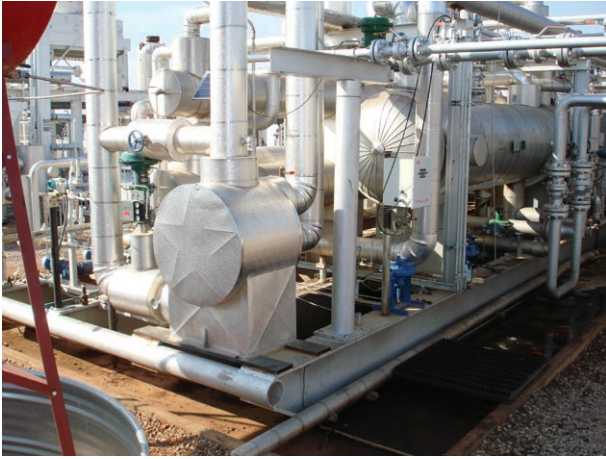
Figure 4. Tranter Supermax shell and plate heat exchanger mounted in a propane recovery skid.

focus for many manufacturers is the development of welded plate heat exchangers. These units have proven to withstand challenging process conditions with liquids, gases, steam and two phase mixtures, including aggressive media and organic solvents. Especially two applications, gas suction cooling and bunker oil heating are two areas where all welded plate heat exchangers could contribute to higher process efficiency and lower investment cost.