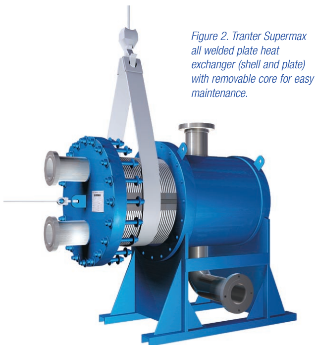
Figure 2. Tranter Supermax all welded plate heat exchanger (shell and plate) with removable core for easy maintenance.

Even though the general working principle is the same, constant product/application development is enabling a wider use of plate heat exchangers in hydrocarbon processes. The applications for gasketed units are well known so the area of