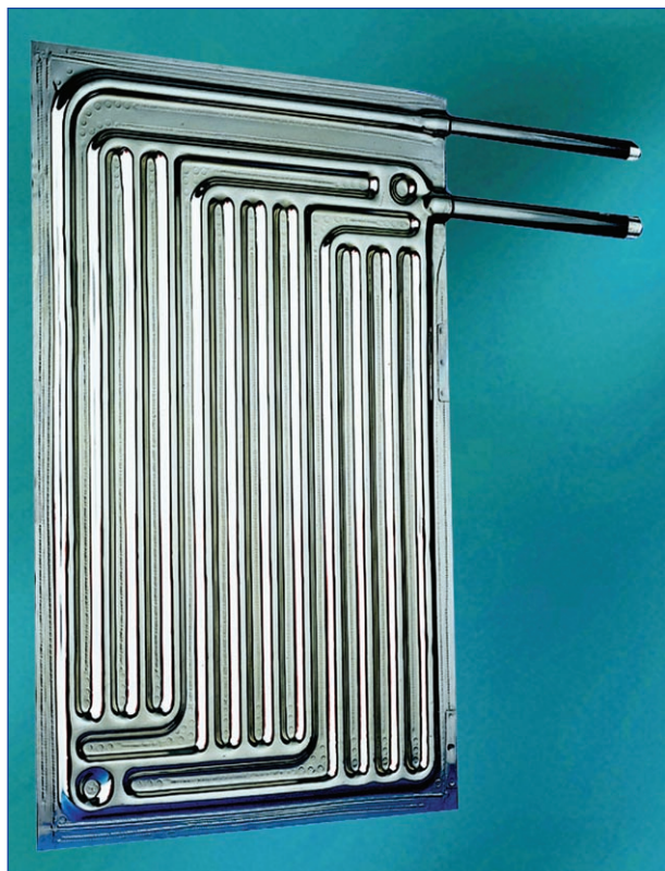
Figure 3. Tranter plate coil all welded heat exchanger suitable for bunker oil heating.