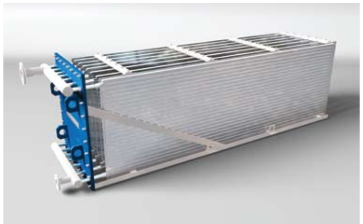
PLATECOIL® banks mounted downstream of the scrubber outlet raise gas temperature for better dispersion.

Wet venturi scrubbers are used for particulate and sulfur dioxide removal. The scrubbing medium is lime, either high calcium or dolomitic. Scrubbing efficiency for SO 2 is 95% and for particulate 99.5%.