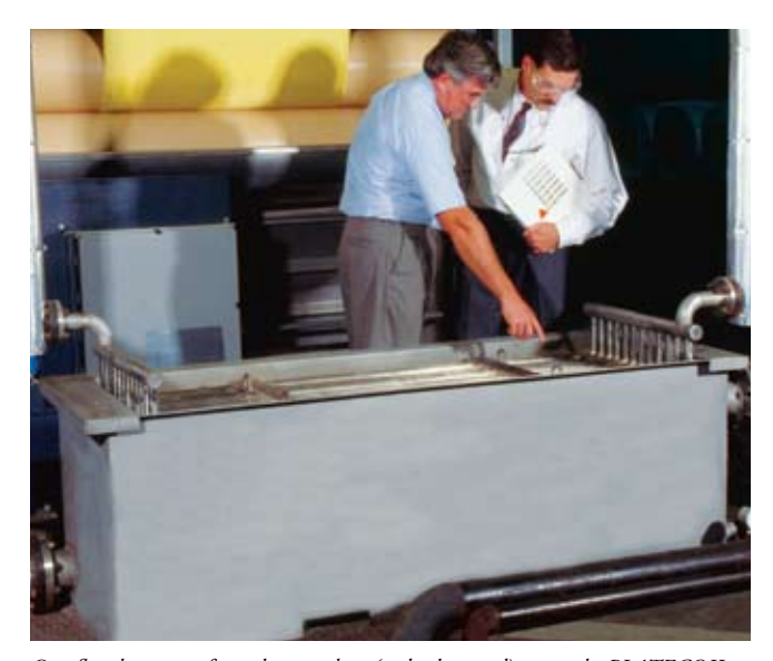
Overflow hot water from three washers (in background) enters the PLATECOIL bank at lower left at 90°C (195°F), then transfers heat to fresh water before exiting to an outside drain (bottom right) at 57°C (135°F).

In addition to fabric washing, the application has merit for pulp, nonwovens, natural or synthetic fibers—anywhere heat can be recovered from a spent filtrate.